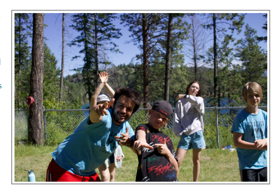
REMEMBER THE 3 PS!