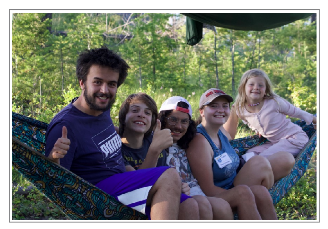
SEE YOU @ CAMP!

meet supporters like you. I believe that nobody ever really grows out of camp so come and join the fun! Whether you want to volunteer for a week or just pop by one night for campfire worship, all supporters and friends of Glacier Camp are welcome. And if you are coming to TIM Talks or any other Spruce Lodge events then be sure to find a moment to come down site and observe summer camp in action.