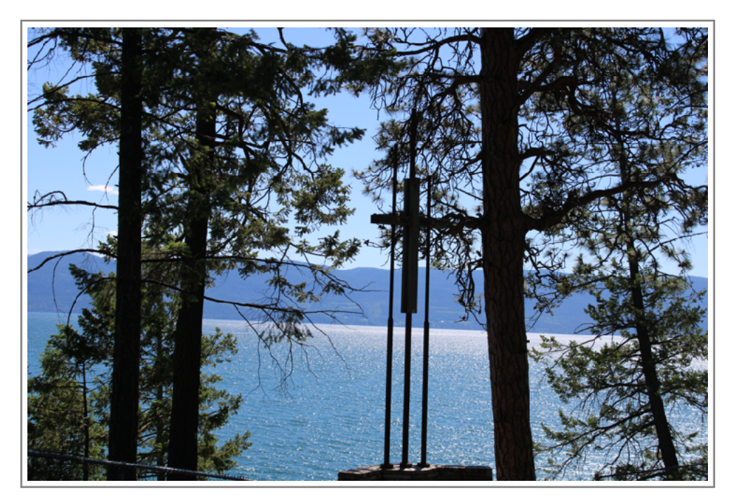
PRAYER AND WORSHIP ARE THE BEDROCK OF OUR MINISTRY

Please pray for new staff to feel welcome and integrate quickly; for campers to come to know God in a fresh way; for good weather; for safety from hazards; for unexpected blessings. Prayers are the bedrock of everything we doincluding summer camp.