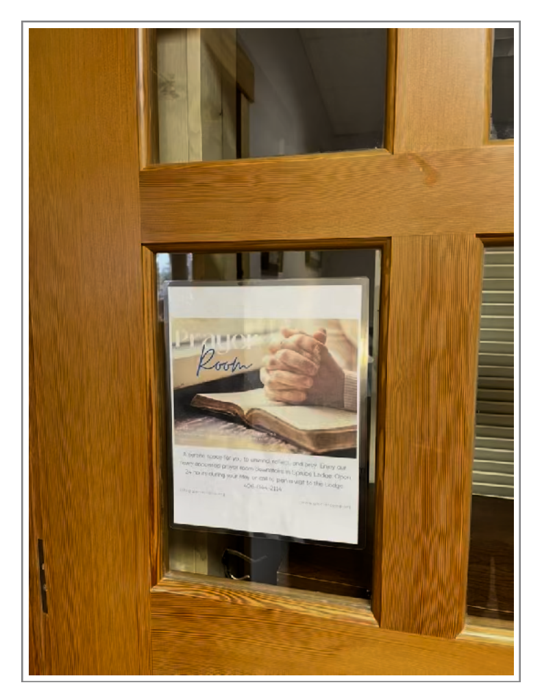
COME AWAY ... AND REST FOR A WHILE: THE LOWER LEVEL CAMP OFFICE IS NOW A PLACE FOR PRAYER AND REFLECTION

Our new prayer room has opened and was immediately used. This tranquil space will be