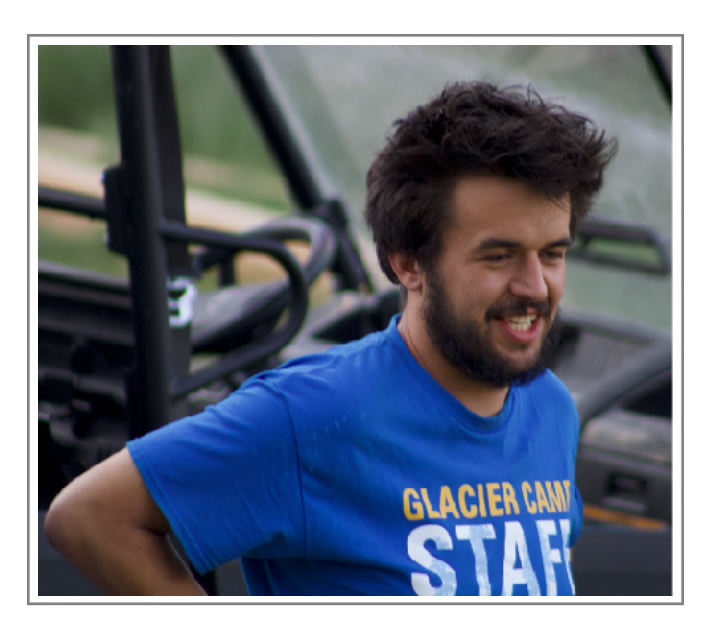
OLLY AT WORK, SUMMER 2024

lly here, writing in from Great Britain. I'm unbelievably excited to fly out in a couple of months and rejoin the camp team for 2025. And what a team it's going to